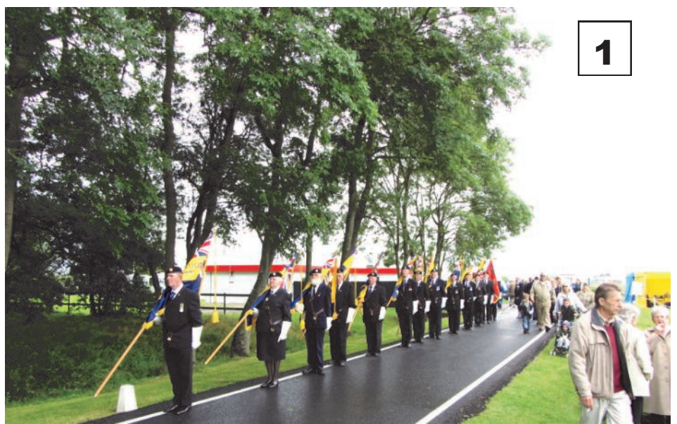
Thurleigh Museum Marks Its Ten-Year Celebration on July 8th